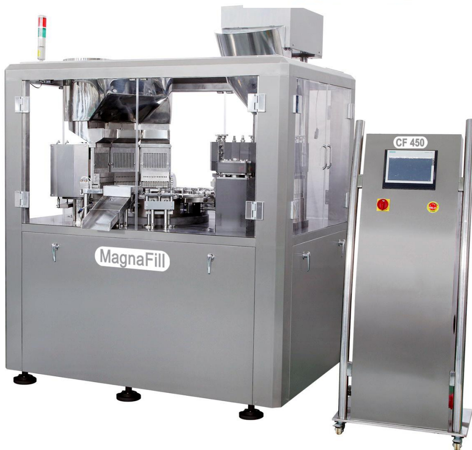
MagnaFill CF 450