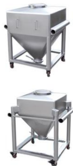
LDT Pharma Bin